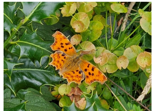
Comma Butterfly in St Mark's garden